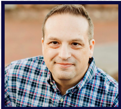
DAVID W BROWN US HOUSE D5

The Fundraising Committee has taken the shared burden of our current circumstance and turned it into fuel for their newest project. The 2020 Blue Pledge Campaign has been redesigned with a fresh perspective and stylish gifts that include t-shirts, bumper stickers and stemless wine glasses for recurring donors. Following our True Blue values the campaign pledges 10% of all donations to Crisis Assistance Ministries, acknowledging we are a community first and access to healthy, whole foods is a human right! Check it out here .